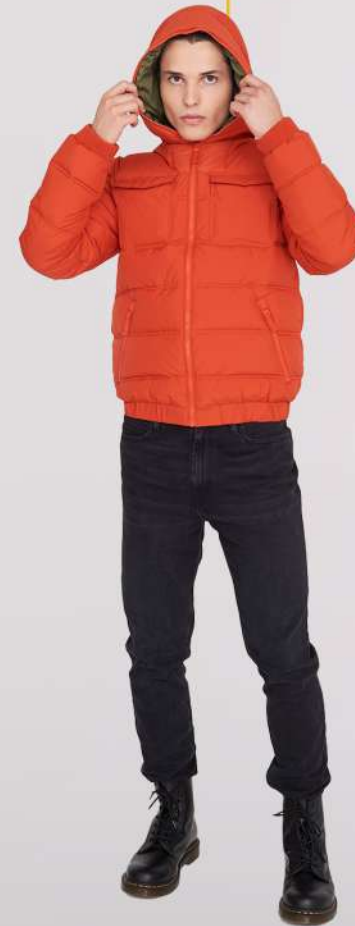
CLASSIC PUFFER JACKET