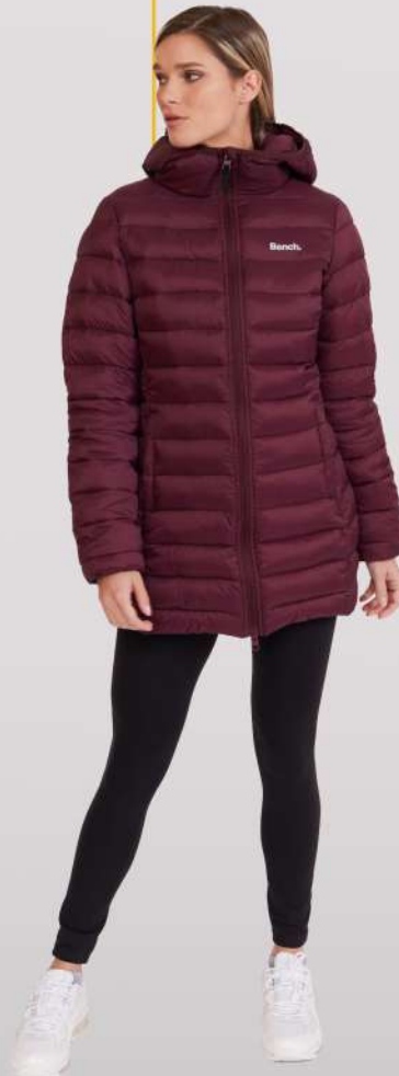
BLUE MOON PUFFER JACKET