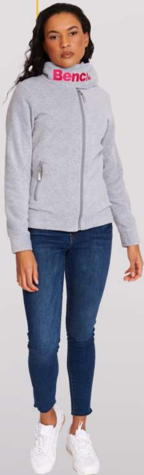
FUNNEL NECK FLEECE